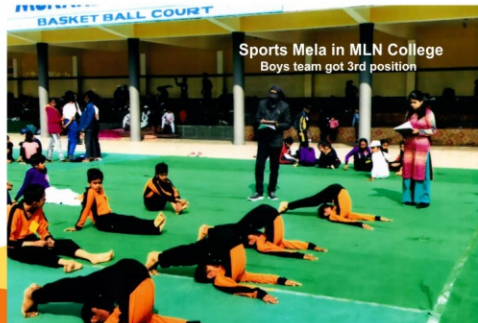
Sports Mela in MLN College Boys team got 3rd position